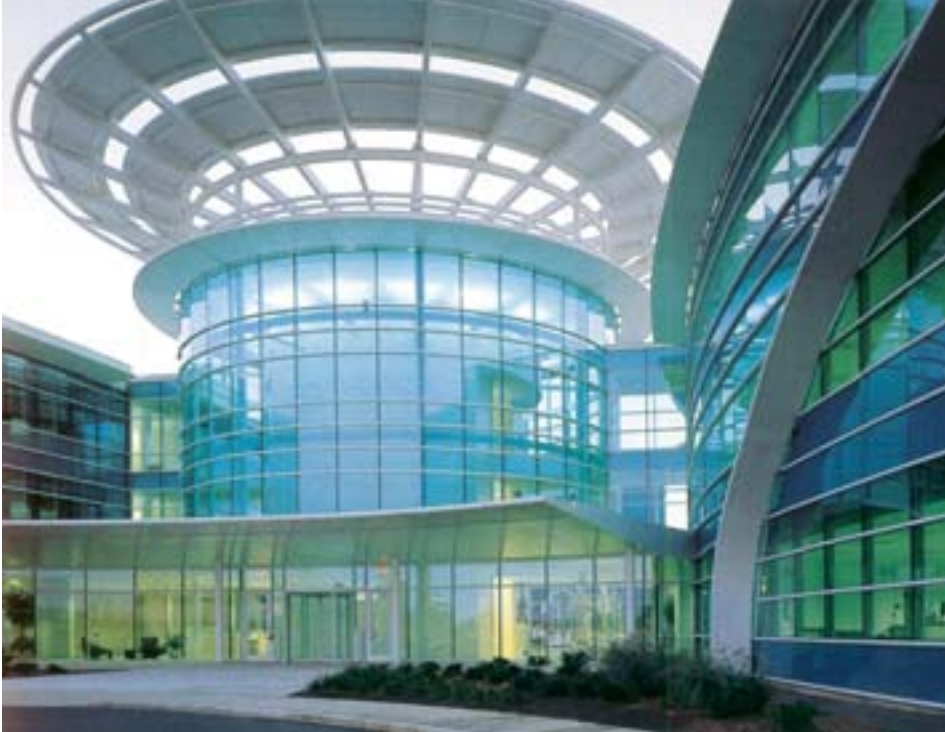
EDWIN AXEL'S COMPANY DESIGNED AND MANUFACTURED ARCHITECTURAL ORNAMENTATION FOR THE APPLIED INDUSTRIAL TECHNOLOGIES BUILDING (ABOVE) IN CLEVELAND.